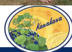
Kawakawa Y4/5 Kawakawa Y6