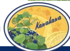
Kawakawa Y5 Kawakawa Y6